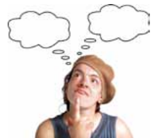
Activity sheets to help people stay safe and learn what to do in worrying situations like being followed or getting lost.