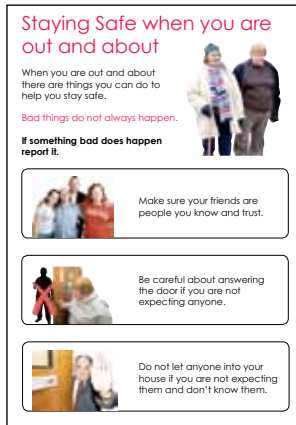
Staying safe when you are out and about