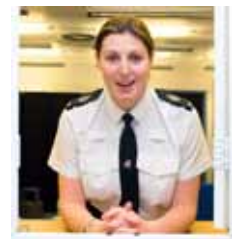
Guide to reporting crime to the Police