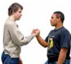
Mate Crime. A guide to the difference between a real friend and a pretend friend