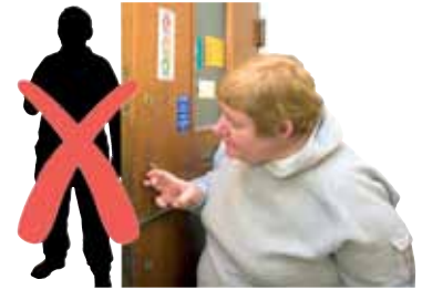
Staying safe when you are at home. Tips from The Police, Trading Standards etc