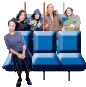
Information about what to do if picked on by young people