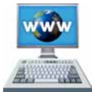
Easy Read reporting form on the Police website